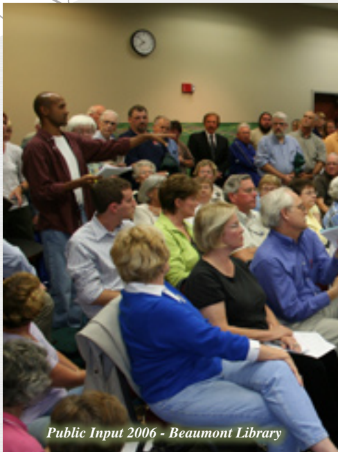
Public Input 2006 - Beaumont Library