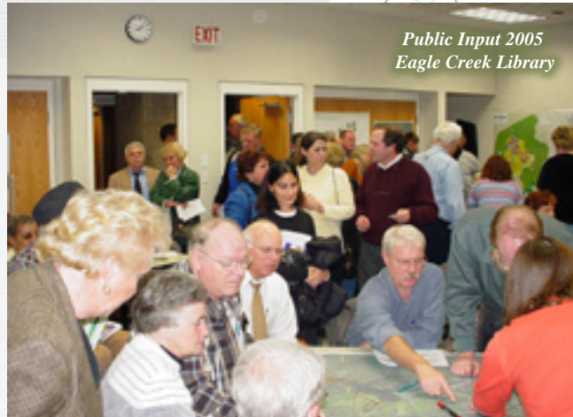
Public Input 2005 Eagle Creek Library