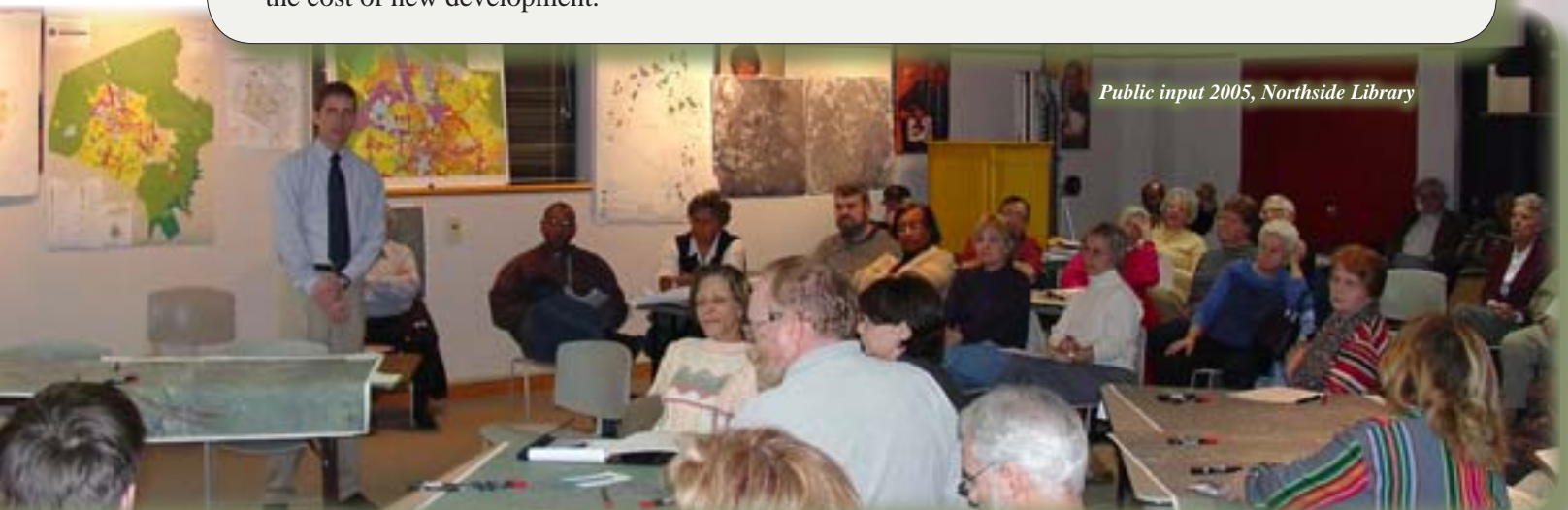
Public input 2005, Northside Library

There were concerns about the high cost of housing and the lack of affordable housing. There were numerous questions raised about development design and the need for more options in the development codes. There was also the belief that citizens in existing developments bear a disproportionate share of the cost of new development.