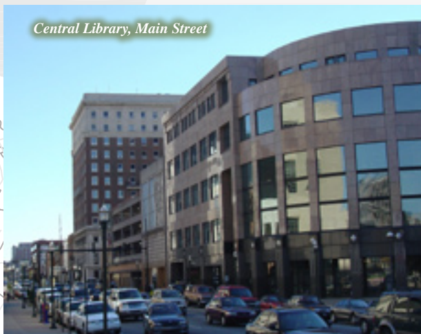
Central Library, Main Street