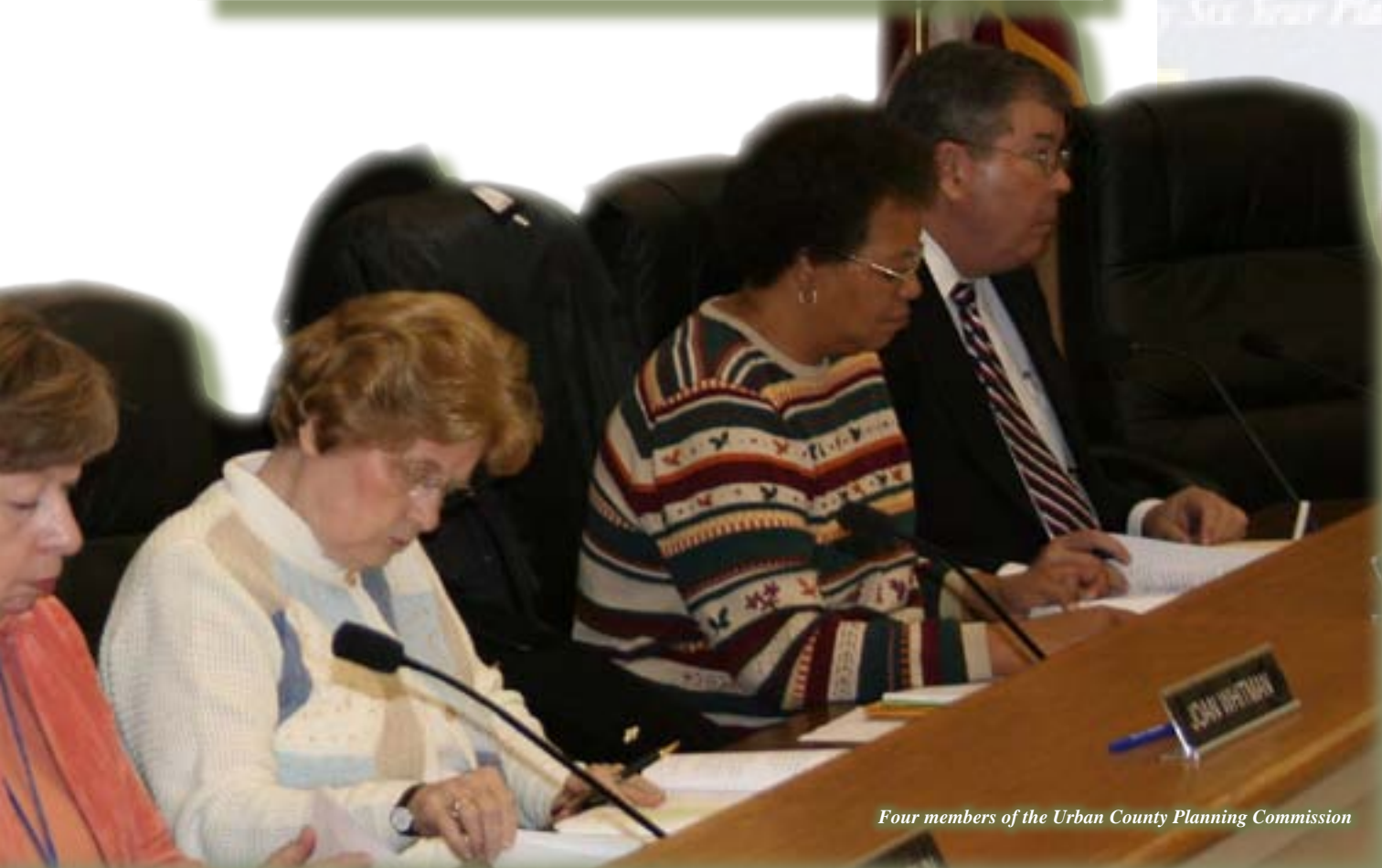
Four members of the Urban County Planning Commission