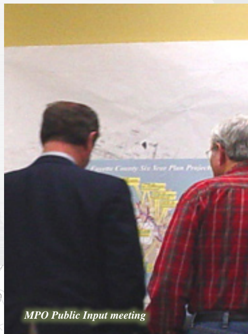
MPO Public Input meeting