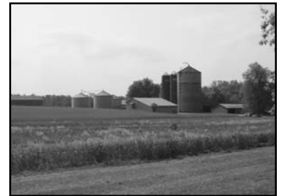
Fayette County Farm