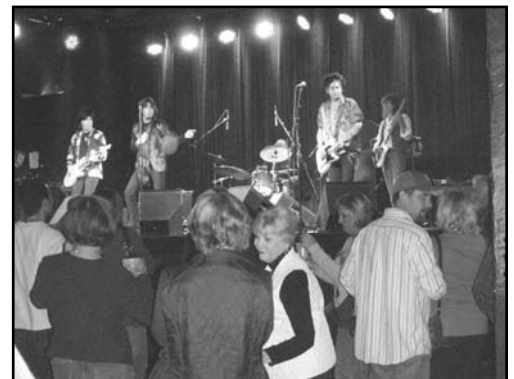
“ Satisfaction, a Rolling Stones Experience ”