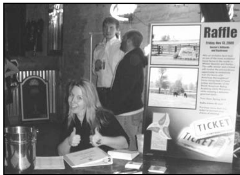
Allies at the “ Our Town, Our Farms ” Benefit Concert