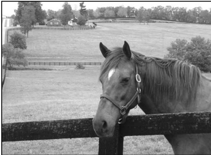
Movement", Business Lexington, 8/21/09.