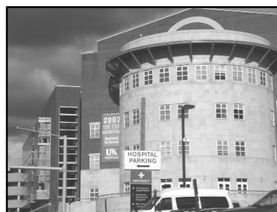
University of Kentucky Hospital

in investment inside Lexington's urban core.