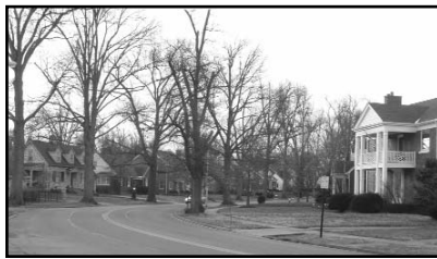
Fayette County neighborhood

While we are currently watching several matters at LFUCG, the following are those that have crystallized in the last three months. To learn more, please visit FayetteAlliance.com .