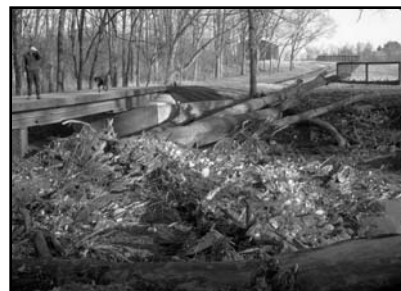
Bridge debris from trash

importance of responsible growth here in Lexington-Fayette County and the greater Bluegrass Region.