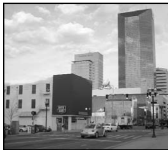
Block before demo.

The Courthouse Overlay Board, and if necessary the Planning Commission on appeal, achieves this goal by using applicable design standards and other requirements to approve or disapprove