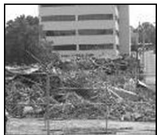
Woolworth block after demo.

development proposals in the CADO zone — an analysis that involves balancing new, appropriate construction in the area's established and unique urban landscape. Therefore, how projects interact with,