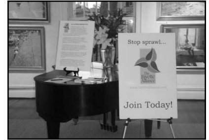
Allies' Cocktail Party.

The Fayette Alliance and the community at large.